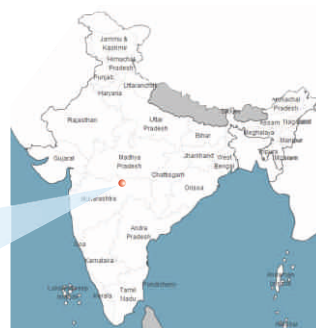
Map of Akola, Maharashtra